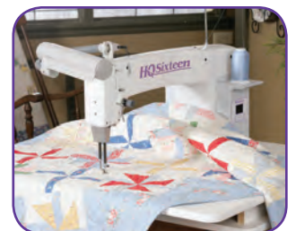
HQ SIXTEEN SIT-DOWN®