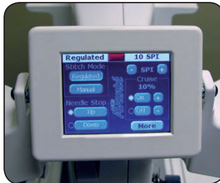
COLOR TOUCH-SCREEN ON FRONT AND BACK HANDLEBARS