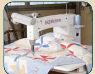
HQ SIXTEEN SIT-DOWN