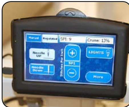
COLOR TOUCH-SCREEN ON FRONT AND BACK HANDLEBARS