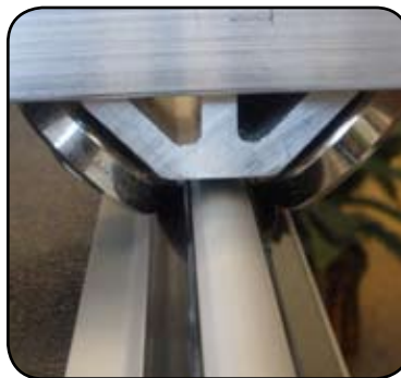
PRECISION-GLIDE ALUMINUM TRACK SYSTEM

SEE ONE OF HUNDREDS OF TRAINED HQ REPRESENTATIVES IN YOUR AREA FOR DETAILS.